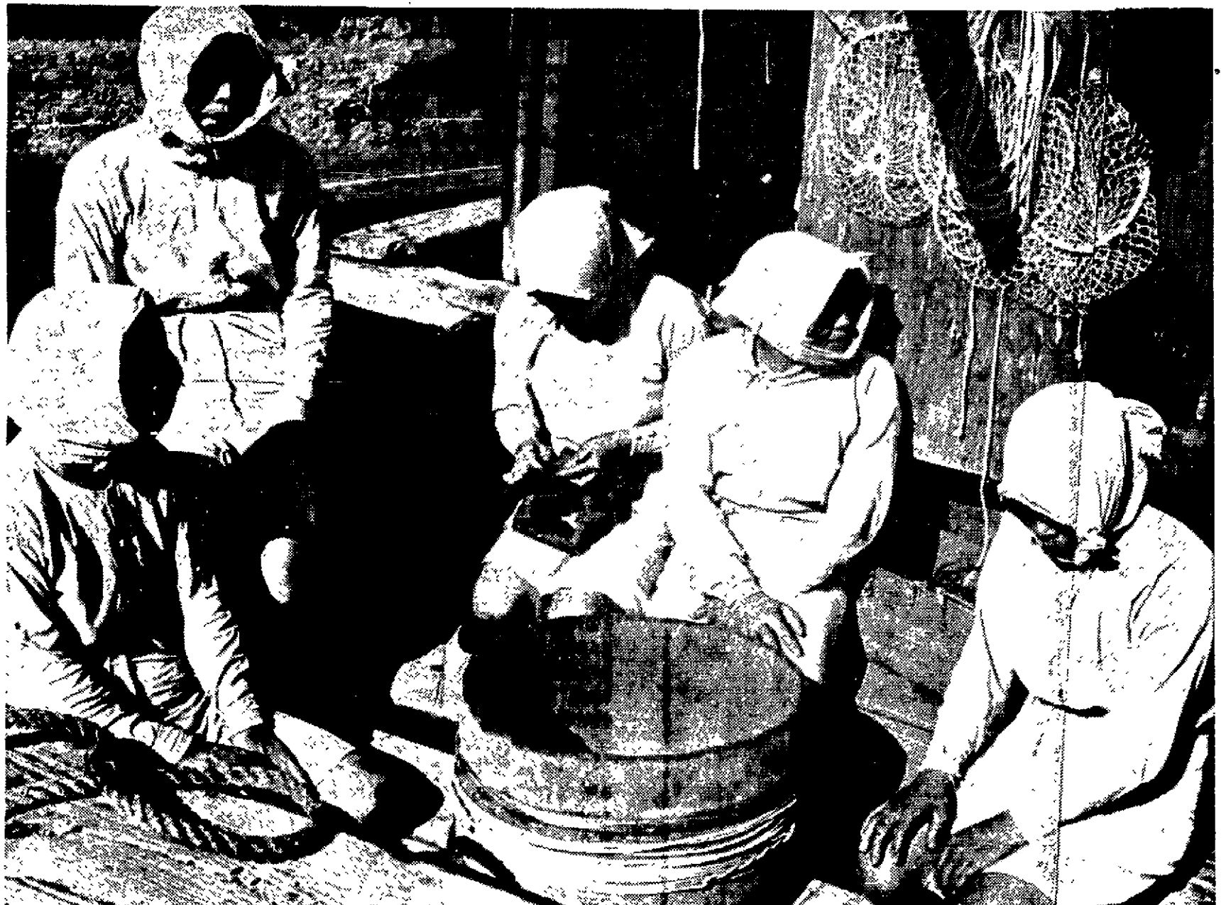
RESTING BETWEEN DIVES , the women sit in the sun and chat. The amas usually range in age from 17 to 21 and are mostly used instead of men because of their great lung power. When girls retire from diving they usually are relegated to oyster cleaning ashore.