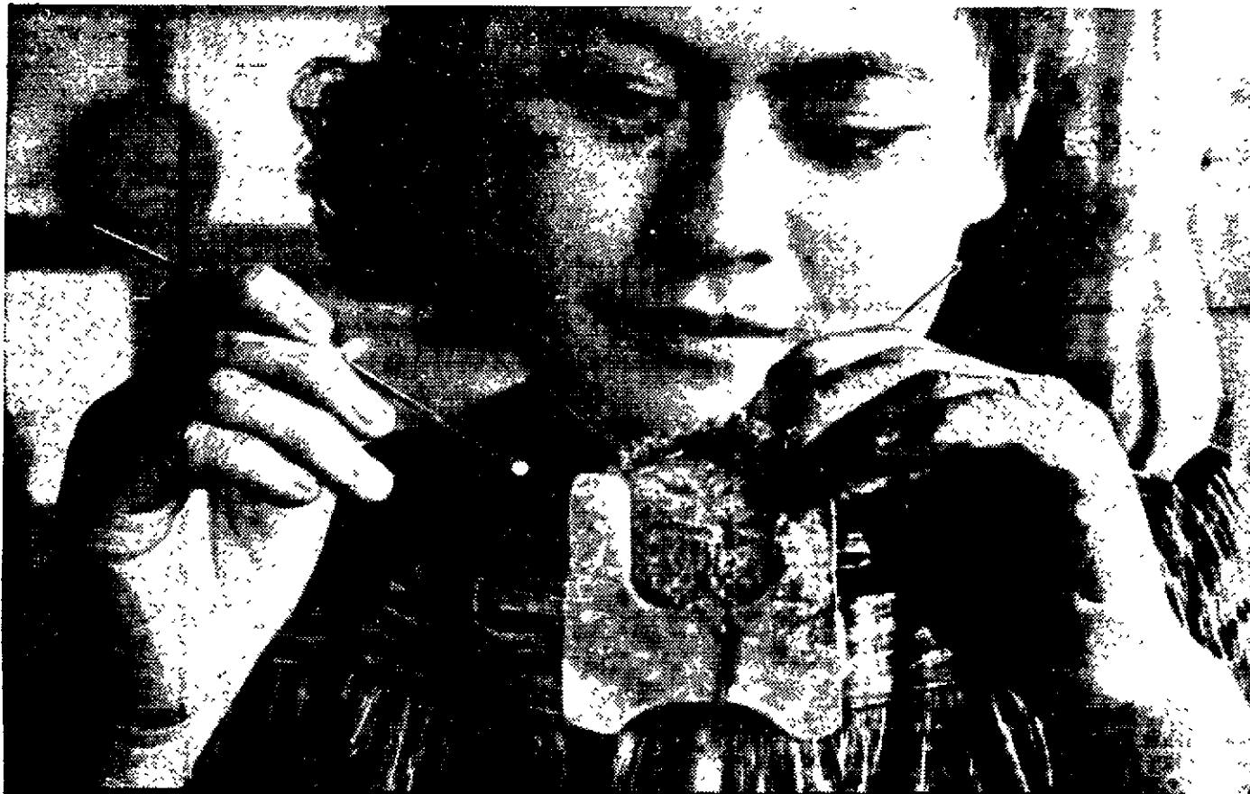
A girl worker prepares to insert a mother-of-pearl bead into oyster that has been in an anesthetic solution.

"Lot 88"—When Gen. Douglas MacArthur invaded the Japanese mainland, his troops found a fabulous cache of choicest pearls ever seen (pictured above). He ordered the pearls sold. The lot went to Joseph Goldstone of the Imperial Pearl Syndicate.