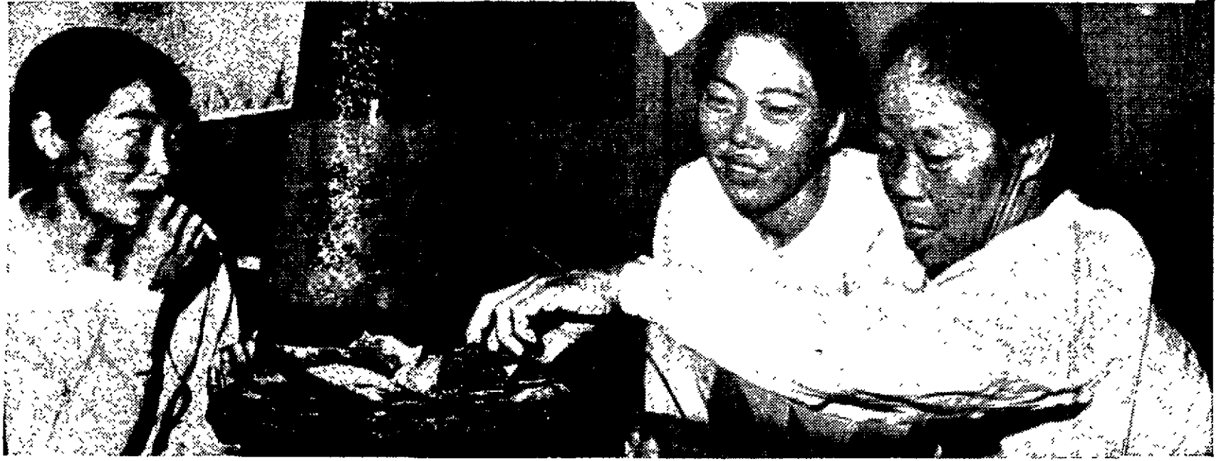
KNEELING on reed mats inside the diving boat, two girl divers enjoy lunch of roasted clams cooked by a member of their fraternity.