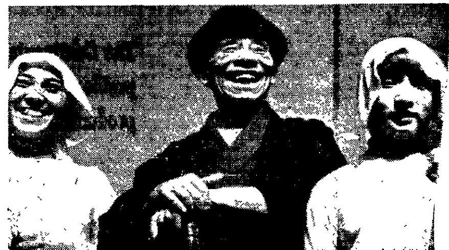
Smiling ruler of Japan's pearl industry, 94-year-old Kokichi Mikimoto with two of his divers. Tycoon calls amas "my children."