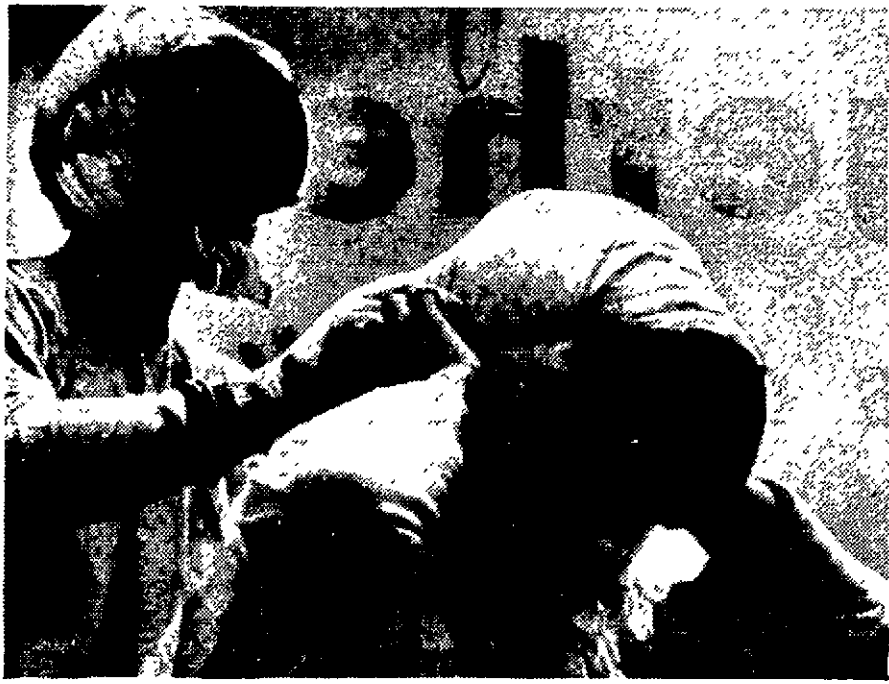
PREPARING to descend for the inspection of one of Mikimoto's pearl-oyster crops, two girl divers help each other adjust diving masks.