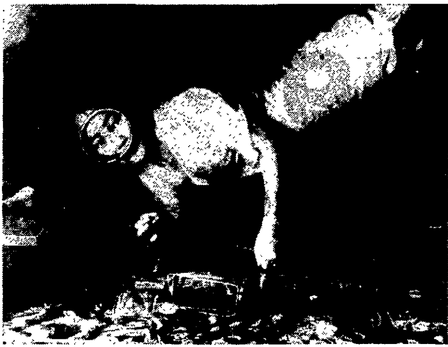
AMA (DIVER) feels her way over the dark ocean floor as she replaces impregnated oysters in containers where they will remain 3 to 5 years.

"Lot 88"—When Gen. Douglas MacArthur invaded the Japanese mainland, his troops found a fabulous cache of choicest pearls ever seen (pictured above). He ordered the pearls sold. The lot went to Joseph Goldstone of the Imperial Pearl Syndicate.